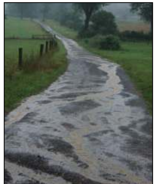
Low volume access lanes such as this are ideal candidates for diversions.