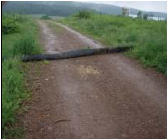
Completed Conveyor Belt Diversion

CONVEYOR BELT DIVERSION – A structure used on low traffic roads to divert water off the road surface. It consists of a piece of used conveyor belt bolted to treated lumber and buried in the road.